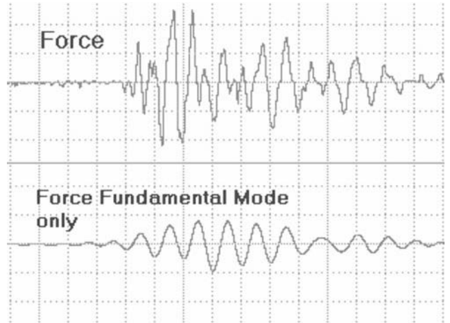
Fig. 1: Seismic event measurements