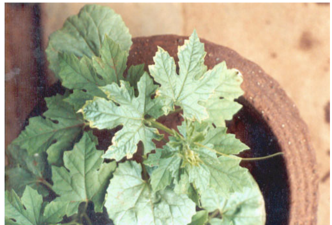
Fig. 1. Bittergourd leaves infected by ICMV showing the mosaic mottling.

The presence of ICMV was also confirmed using a degenerate primer pair for geminiviruses (Deng et al. 1997) and a specific primer pair for the ICMV coat protein region (Patil et al.