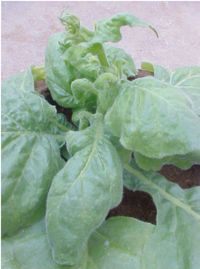
Fig. 3. ICMV-infected Nicotiana benthamiana leaves showing symptoms of rosetting.

2005). The sizes of the amplified products were 560 bp and 800 bp, respectively (Fig. 4). The amplified product of the ICMV coat protein from bittergourd was cloned and sequenced. The sequence was submitted to GenBank (accession number DQ780004). The most similar protein within GenBank was the coat protein of ICMV from cassava (accession number AY998122; 99% similarity). To date there are no reports of ICMV on cultivated crops other than cassava in India. In our study we identified the occurrence of ICMV on bittergourd grown in Tamil Nadu, India.