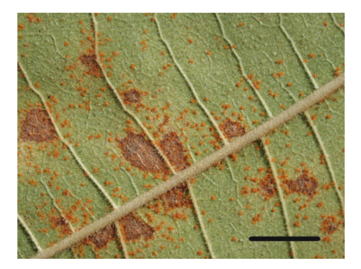
Fig. 1. Uredinia of Olivea tectonae on the lower leaf surface of Tectona grandis (bar = 10 mm).

Teak typically becomes dormant and loses its leaves during the dry season (May to October) in the northern region of Australia but some plantings that are irrigated maintain foliage for their entire productive life. This may mean that O. tectonae is capable of existing indefinitely in an irrigated planting as urediniospores, the only spore type known to occur in Australia. In addition, there are over 50 species of Verbenaceae (native and introduced) occurring in the Northern Territory (Dunlop et al. 1996) and it is not known