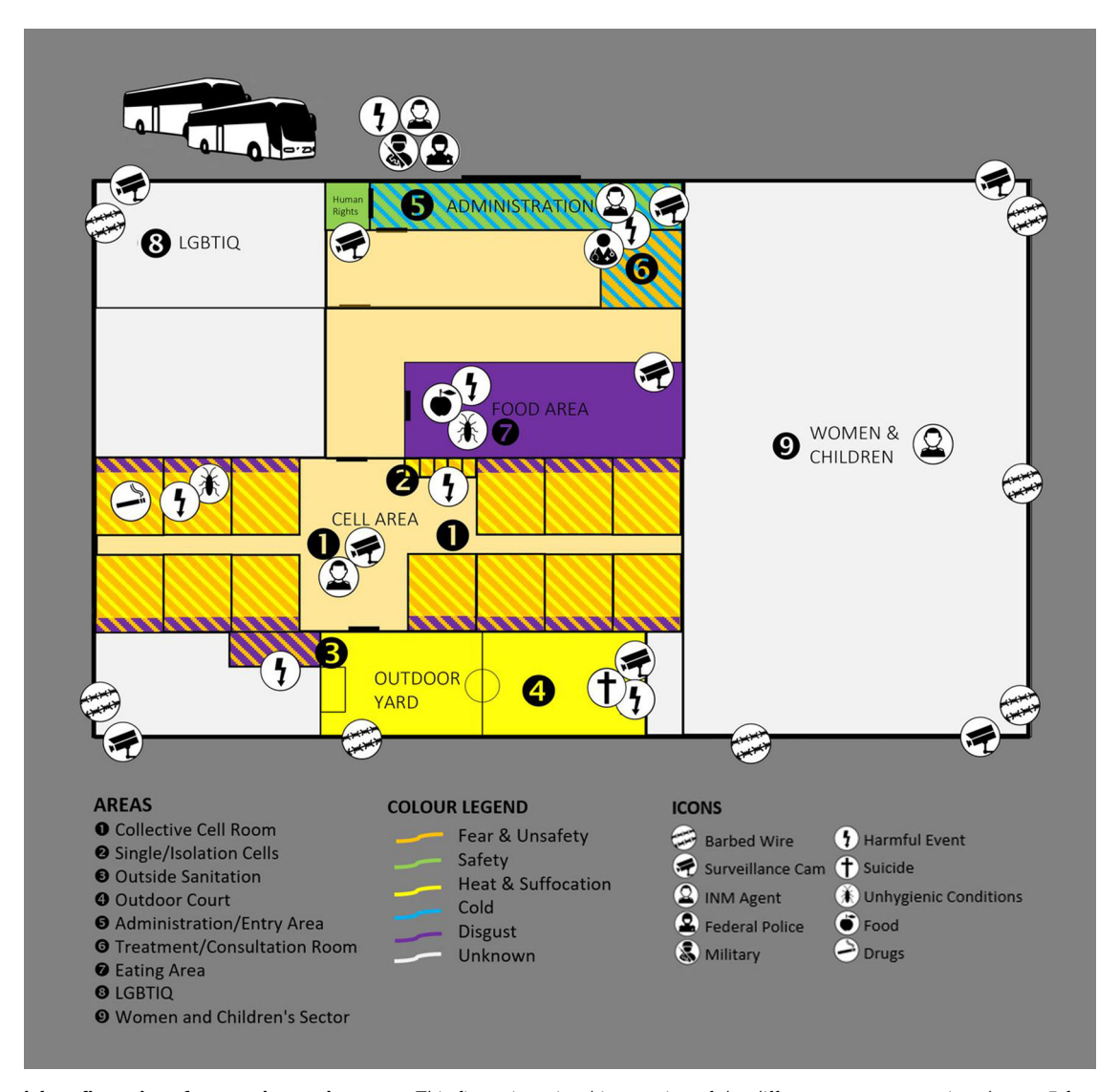
Fig. 3 A spatial configuration of a torturing environment. This figure is a visual integration of the different counter-mappings by n = 5 former detainees and n = 5 participants of the group of key actors. The integration portrays an estación migratorias from the perspective of an adult cis-male inmate. The figure indicates different areas. Colours represent emotions linked to a certain place. Icons describe the infrastructure, conditions of the detention's environment, incidents and different state actors. This figure is covered by the Creative Commons Attribution 4.0 International License. Reproduced with permission of Julia Manek; copyright © Julia Manek, all rights reserved.

detention time and the emotional constraints of the detainees emerged nor differences between the two groups of detainees (released vs. detained) regarding their mental health: dehumanisation starts right at the gate. Already the arrest and the first hours in an estación migratoria may represent a profoundly and lasting shattering experience (see Fig. 3).