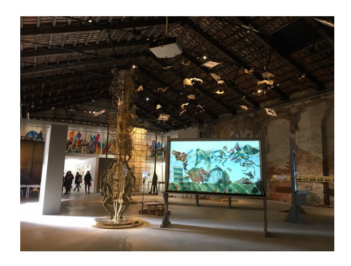
Fig. 1 A general view of The China Pavilion at the 2017 La Biennale di Venezia, 57. Esposizione Internazionale d'Arte.

this bu xi takes on an essentialist quality as it is a part of a "Chinese cultural gene" which "has given rise over the generations to powerful creative work that resonates with an esthetic, philosophical and cosmological continuity …" (Wall Text, "Continuum" 2017).