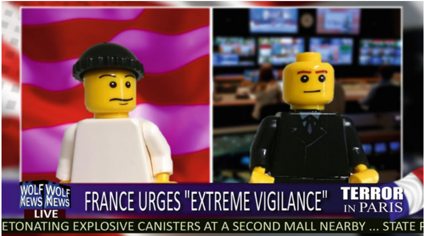
Fig. 4.2 An expert on Wolf News tells us about religion in Europe: ‘there are actual cities, like Birmingham, that are totally Muslim, where non-Muslims just simply don’t go’