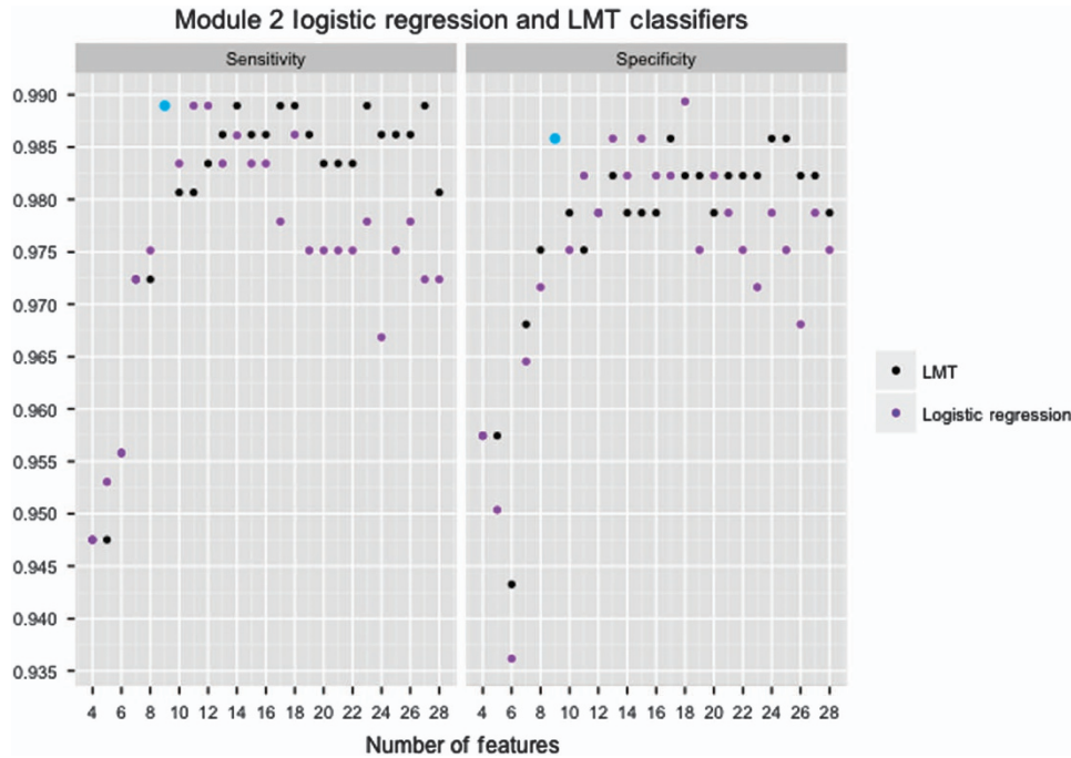
Figure 1. Module 2 logistic regression and logistic model tree (LMT) training results. Sensitivity and specificity of the module 2 logistic regression and LMT classifiers based on the number of features used during training on the National Database of Autism Research are provided in Table 1. The nine-feature logistic regression classifier (blue dot) was used in testing.

44 individuals with ASD who were misclassified, clinical diagnoses were available for 30. Six had a confirmed autism diagnosis, six had Asperger's disorder and the remaining 18 had pervasive developmental disorder—not otherwise specified. For the six