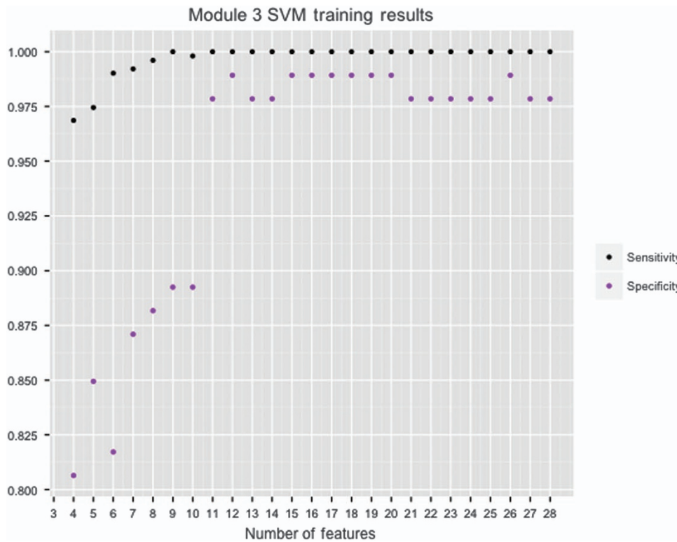
Figure 2. Module 3 SVM training results. Sensitivity and specificity of the module 3 SVM classifier based on the number of features used during training on Autism Genetic Resource Exchange are provided in Table 1. The 12-feature SVM classifier was used in testing. SVM, support vector machine.