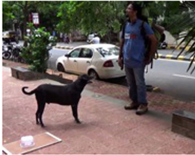
Figure 1. A free-ranging dog on the streets of India ‘looking back’ towards the experimenter during the unsolvable trial.

animals, leading authors to conclude this was likely an effect linked to their longer experience with humans in comparable situations 6,7 . Taken together, these results highlight that both the degree and type of interaction with humans has strong effects on their ‘looking back’ behaviours in such tasks.