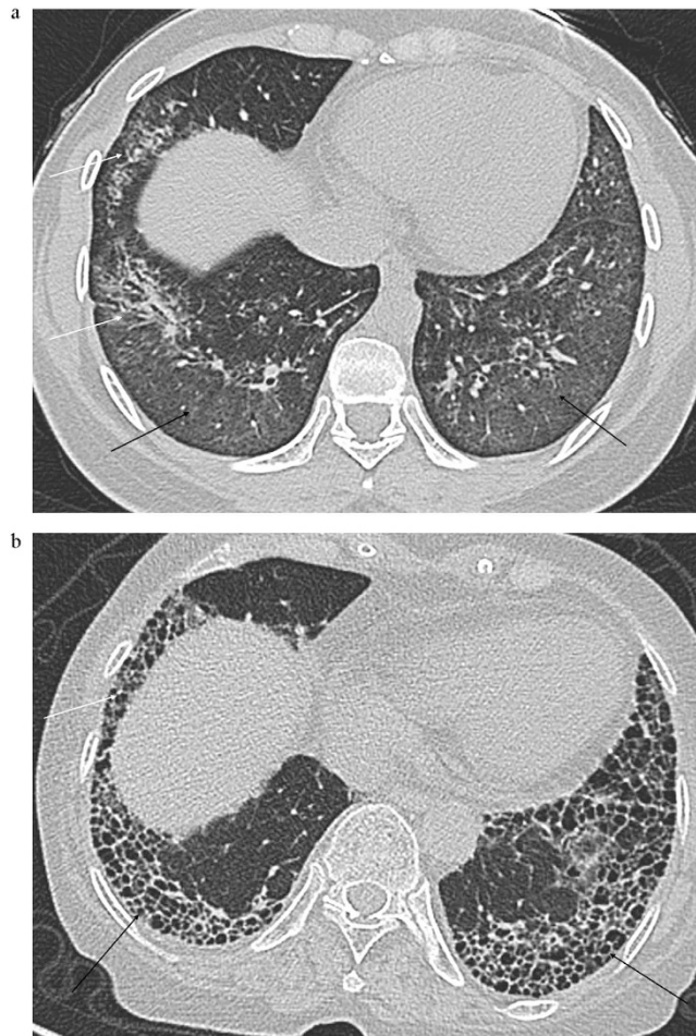
Figure 2. Representative HRCT images for RA-ILD. (a) ground-glass opacification (black arrow) and traction bronchiectasis (white arrow), (b) Honeycombing (black arrow) and reticular abnormalities (white arrow).

were a diagnosis of RA made by at least two rheumatologists according to the American College of Rheumatology 1987 criteria 28 . Both HRCT imaging scan of the chest and pulmonary function test were performed to assess respective abnormalities suggestive of ILD. Demographics and clinical features were extracted from the database. Patients with neoplasm were excluded. The study protocol was approved by the Institutional Review Board of West China Hospital of Sichuan University, and all participants gave written informed consent. The methods were carried out in accordance with the approved guidelines.