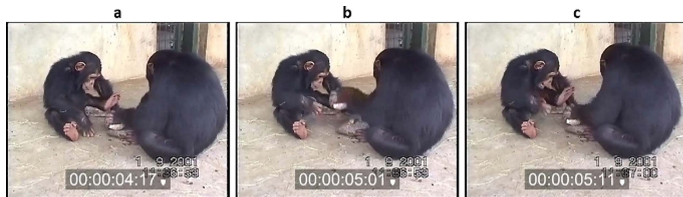
Figure 1 | Baluku observing Mawa. Sequence of stills (a, b, c) from Video 1 showing Baluku (left) as the observer and Mawa (right). Mawa is holding a stone in his left hand and using it to crack a nut in front of him. Baluku is moving his right hand without a stone in his hand or a nut to crack.

In the light of these controversies, the videos from the Marshall-Pescini and Whiten experiment (2008), containing some of the only documentations of apparent motor mimicking in apes, have been met with interest and were cited as evidence for inter-individual action coding in chimpanzees. It has been suggested, for example, that the motor behaviour exhibited in the video materials is functional in that it provides the learner with kinaesthetic feedback 49 , is consistent with direct inter-individual action coding at a motor program level 9,41,49 , indicative of bodily imitation 8,50 , related to inter-individual synchronisation observable, for example, in bird flocks, and linked to mirror neuron systems 51 .