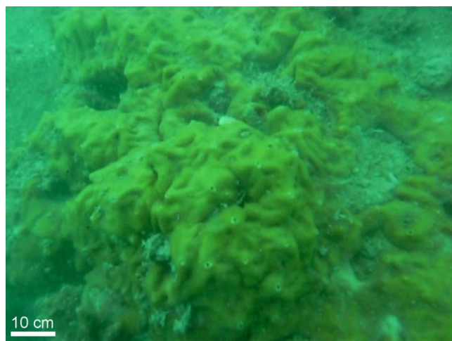
Figure 3 | Demosponges associated with coral reef. This green-coloured encrusting sponge is well distributed within the coral reef system of Palinurus Rock.

These valuable habitats urgently need protection, conservation, and research. This is a particular challenge the Gulf area due to the extensive oil and gas exploration. Countries formerly experiencing major disputes now share common marine habitats, opening the door for political as well as scientific action. Monitoring these rare reefs will require intense communication between experts from many nations, and the results will have global implications.