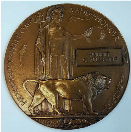
Fig. 2 'Dead Man's Penny'

Understandably, relatives wished to have remembrance of loved ones closer to home. A bronze memorial medallion, rather grimly nicknamed 'Deadman's Penny' (Fig. 2), was issued to the next-of-kin. This, together with a photograph of the deceased, was often found in homes as a 'shrine'. Memorial monuments or plaques can be found in villages and towns. Sometimes utilitarian memorials with a practical purpose, such as the provision of libraries, parks, or hospitals were built. Those on the BDA Memorial are also remembered or buried close to where they died. Those who lost their lives at sea are commemorated at Chatham Naval Memorial in Kent.