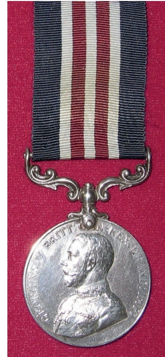
Fig. 8 The Military Medal awarded to non-commissioned ranks of the British Forces for bravery. Established on 25 March 1916. The Military Cross has been awarded to all ranks since 1993 when the MM was discontinued.