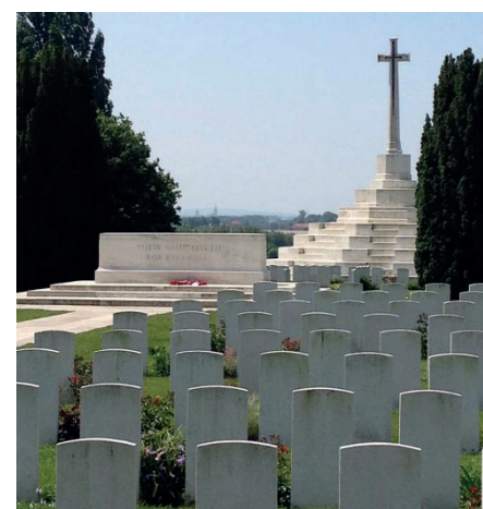
Fig. 1 Stone of Remembrance and Cross of Sacrifice at Tyne Cot Cemetery

The Cenotaph in Whitehall, London was originally built as a temporary, wooden structure by Lutyens for the London Victory Parade in 1919. Owing to its popularity, a permanent structure of Portland stone was constructed in 1920. The inscription of 'The Glorious Dead' differs from those memorials on the battlefields in its allusion to glory in battle and triumph.