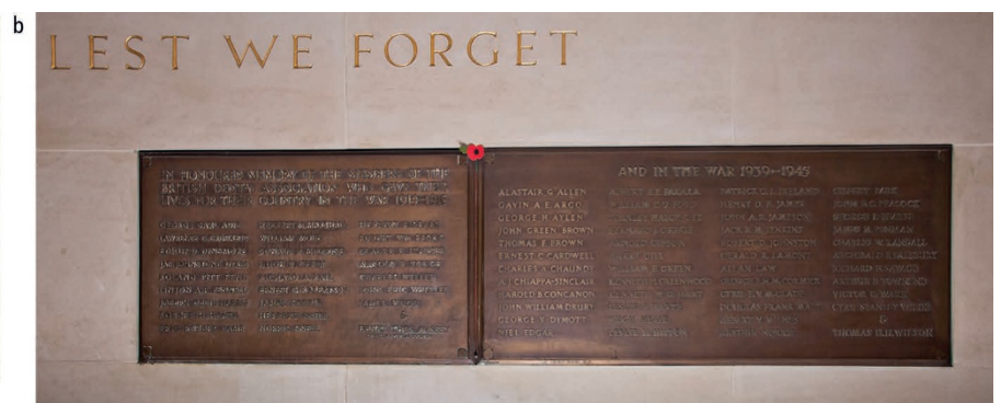
Fig. 3 War Memorial at Russell Square (a) and at Wimpole Street (b)