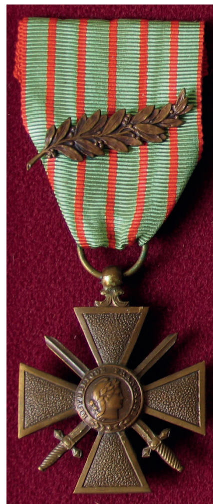
Fig. 11 Croix de Guerre 1914-1918 with Palm. The Croix de Guerre 1914-1918 was awarded by France to members of the French military or their allies displaying valour in battle during WW1. The palm represents the citation of gallantry at army level.