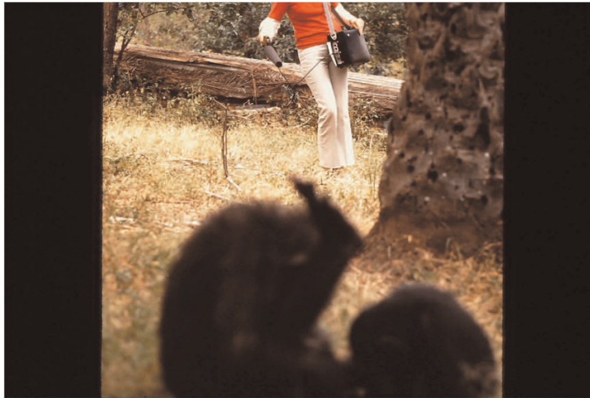
Figure 2. The recording situation of the chimpanzee vocalizations in the Kakombe valley in the feeding area (see Figure 1b). This was the open place where Jane Goodall fed the chimpanzees. At a distance between 5–15 meters the recordist (red sweater) was carrying a Nagra sound recorder (full track mono, 19 cm/s) and pointed a Sennheiser MKH 815T directional microphone (covered with a windhose) at the chimpanzees (shaded figures in the foreground).

specification of the measurement behind the 5 star system, see the Technical Validation section. Notes include the names of the vocalizing individual(s) together with the vocalization(s) of each individual and the behaviour and situation surrounding the vocalizations. Many recordings contain multiple calls by multiple animals. This means the sample size is overall quite large.