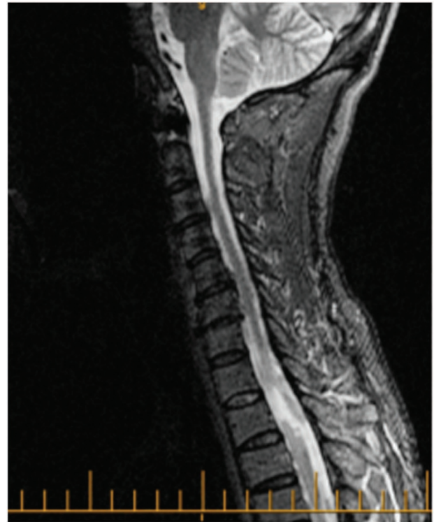
Figure 4. 50-year-old female with hematoma from T1 to T5 measuring 0.65-cm thick and 8.9 cm in length. Improved from ASIA A to ASIA B with surgery.

A 50-year-old female was admitted for the treatment of fever and leukopenia. During her stay, she developed a complete motor deficit from T4 down. Her laboratory blood analyses revealed a low white cell count but were otherwise normal. An MRI done 3 days after the onset of her symptoms showed a four-level epidural hematoma extending from T1 to T5, causing the spinal cord compression seen in Figure 4. The hematoma was 0.65 cm in thickness and 8.9 cm in length. The patient underwent urgent decompressive laminectomy to evacuate the hematoma. Her ASIA score was A pre-operatively and did not change immediately post-operatively. However, a follow-up visit at 3 months showed improvement to an ASIA score of B.