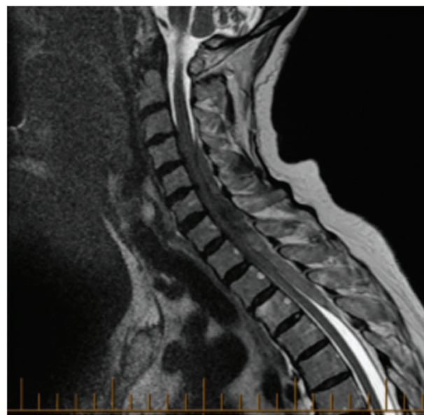
Figure 2. 92-year-old female with hematoma from C4 to T4 measuring 1.2-cm thick and 12.3 cm in length. Improved from ASIA C to ASIA D with surgery.

Literature review yielded a total of 65 SSEH patients, of which 15 were treated conservatively and 50 were treated surgically. Overall, mean age (+/- standard deviation) at the time of SSEH presentation was 53.2 (+/- 23) years. Of the 15 SSEH patients who were treated conservatively, 3 presented with an ASIA score of A (20%), 2 presented with a score of B (13%), 2 presented with a score of C (13%), and 8 presented with a score of D (53%). Upon maximal resolution of the SSEH, 4 resolved to an ASIA score of D (27%) and the remaining 11 fully recovered with a score of E (73%). Of the 50 SSEH patients, who were treated surgically, 20 presented with an ASIA score of A (40%), 12 presented with a score of B (24%), 8 presented with a score of C (16%), 8 presented a score of D (16%), and 2 presented with a score of E (4%). Upon maximal resolution of the SSEH, 6 resolved to an ASIA score of A