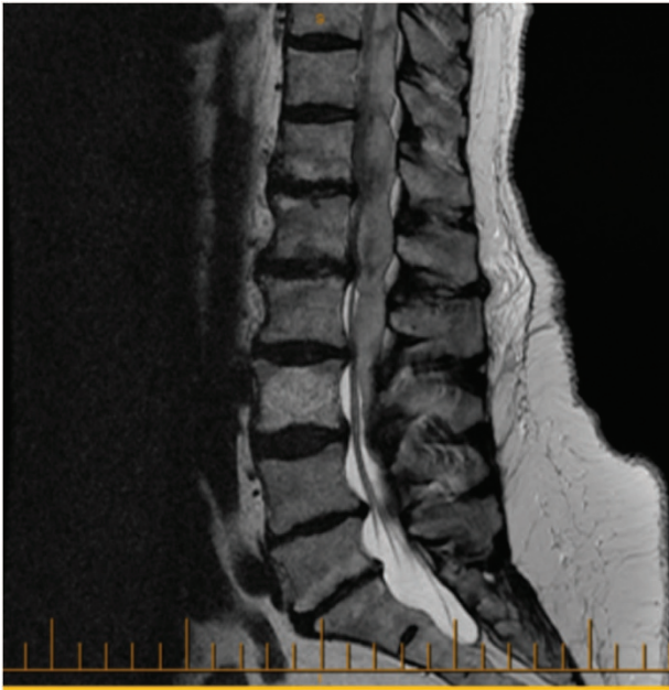
Figure 3. 76-year-old female with hematoma from T7 to L1 measuring 1.2-cm thick and 15 cm in length. Improved from ASIA D to E with surgery.

other limbs were 5/5. Laboratory blood analyses were normal with an INR of 1.04. Urgent MRI showed a large ten-level epidural hematoma starting from T7 to L4, with a thickness of 1.2 cm and a length of 15 cm, causing the spinal cord compression seen in Figure 3. Laminectomy and hematoma evacuations were performed 28 h after the onset of her symptoms. The patient's ASIA score was D pre-intervention and it did not change immediately following surgery. However, she fully recovered to an ASIA score of E at both her 6 and 12 week follow-ups.