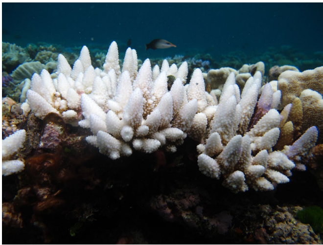
Fig. 3 | Bleached coral of the GBR in 2016. The 2019 Great Barrier Reef Outlook Report assessed the overall outlook for the reef as very poor, and in 2020, global heating caused the corals on the GBR to bleach again for the third time in 5 years, generating grave concerns about the ecosystem's future ability to recover before yet another bleaching event.

leadership. Effective networking requires developing a portfolio of bonding and bridging social capital, then carefully choosing which actors with whom to form repeated relationships and which new communities to branch out to.