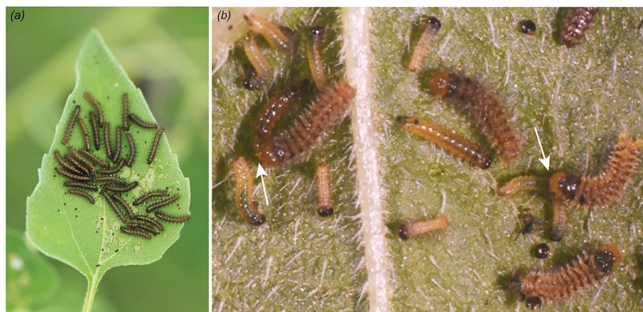
Figure 1. Larvae of Chlosyne lacinia in natural and laboratory settings. (a) Sibling larvae of C. lacinia feeding gregariously on a leaf of common wild sunflower ( H. annuus ) in southern Texas. (b) Larvae cannibalizing conspecifics in preliminary observations separate from our experiments using a No addition treatment. White arrows indicate two cases of cannibalism.

To evaluate the influence of plant sodium concentration variation on larval behaviour and mortality, we conducted two experiments designed to characterize larval responses to dietary sodium concentrations. On average, C. lacinia larvae exhibited contrasting behavioural and mortality responses among the host-plant sodium concentrations. For the first experiment, the proportion of cannibalism peaked at the lowest concentrations (GLM: D = 12.02 , df = 3 , p < 0.001 , Fig. 3a). Cannibalism was only observed once in the High treatment (1.7%). In contrast, in the No addition and Low treatments, cannibalism occurred at higher frequencies. Post-hoc analysis also confirmed the higher cannibalism frequencies in the Low as compared to the High treatment. Within the