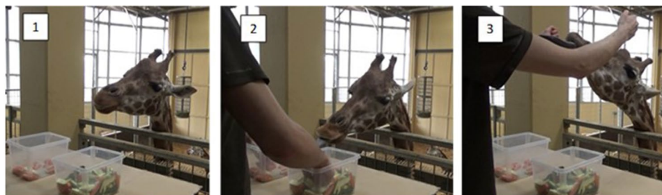
Figure 1. An example of a trial in Experiment 1, condition 2. Picture 1, the experimenter presents the two containers to the subject. Picture 2, the experimenter simultaneously takes one food piece from each container, without the giraffe seeing which piece is taken. Picture 3, the giraffe selects one of the two outcomes by touching it with the tongue.

In the first experimental task, we tested if giraffes were able to make decisions based on the relative frequencies of food items in the containers. We included three different conditions aimed to rule out the use of simpler quantitative heuristics (Table 1). In condition 1, subjects were expected to preferentially choose the container with 100 carrots + 20 zucchinis over the one with 20 carrots + 100 zucchinis if they were comparing relative frequencies. In condition 2, we expected that subjects would prefer the container with 20 carrots + 4 zucchinis over