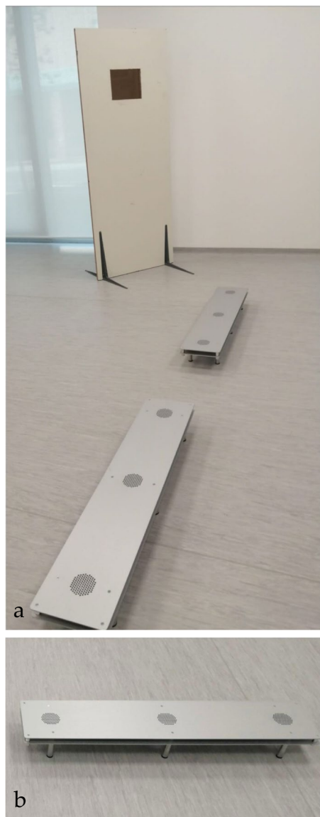
Figure 1. (a) The two especially designed stainless steel and aluminium apparatuses positioned in a single straight line on the floor, spaced 40 cm apart; (b) detail of the apparatus.

At the beginning of the test, before the dog and the trainer entered the room, one positive and five negative samples were selected and placed in the six holders by an experimenter, who left the laboratory soon after. The location of each sample was pre-determined by this experimenter in a pseudo-random order (designed using http://www.random.org ), so that the positive sample was in a different location in each trial. A second experimenter was in an adjacent room, avoiding any interaction with the trainer and observing the dogs' work and behaviour through a digital video-camera (GoPro HERO7, Italy), which was mounted on a wall and operated remotely. The study was double-blinded setting, since the type and position of the samples in the sniffing stations were unknown to both the trainer and the second experimenter.