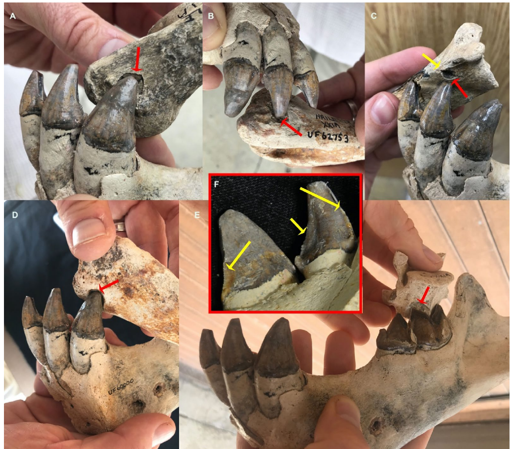
Figure 3. Examples of large tooth marks that fit the size of the Xenosmilus anterior dentition (incisors and canines) (A–D). These marks are found on the medial side of the epiphysis of humeri (A, B) and on the neck of scapulae (C). They are also documented on the proximal tibia (D). A mark that fits the size and shape of the carnassial crest has also been documented on a vertebra (E). Xenosmilus had very large incisors with serrated edges (F) (yellow arrows). They are positioned in a protruding curved arcade. The serrated edges on the carinated incisors and lower canines resulted in frequent bisectioning of the resulting tooth marks (see, for example, the tooth mark on the scapular neck in (yellow arrow in C).