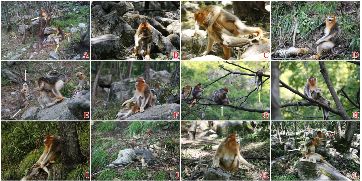
Figure 1. Responses of group members in Rhinopithecus roxellana . (A) The mother (red arrow) holds the dead juvenile (yellow arrow), and juvenile J3 (blue arrow) touches it. The OMU adult male (white arrow) remains nearby in a tree. (B) The mother holds the head of the corpse against her chest. (C) The mother struggles to walk with the corpse. (D) The mother, sitting alone beside the dead juvenile, emits calls. (E) The mother carries the corpse as she moves towards her OMU. (F) After the mother laid some leaves on the corpse a juvenile (teal arrow) approached, looked and left. (G) The mother (red arrow) draped the corpse (yellow arrow) over a branch, and moved to sit near the adult male (white arrow). (H) The mother put the head of the dead juvenile against her left breast, as if breastfeeding. (I) The mother had difficulty carrying the now-clearly decomposing corpse. (J) The decomposing body of the dead juvenile. (K) The mother looks toward where she abandoned the corpse and emits contact vocalizations. (L) The mother (red arrow) grooms the adult male (white arrow).

At 06:20, CM laid the corpse down on the large stone on which she was sitting. She picked up a few leaves from the ground and placed them on the corpse's back. A juvenile approached (Fig. 1F), looked, then left. At 06:21 CM picked up the corpse, carried it over approximately 5 m, and then put it down again; an infant from her unit approached, looked and then left. CM, now sitting alone with the corpse, occasionally vocalized. At 06:45 she picked it up and carried it into a tree, with extra-unit females looking on. At 06:50 CM, sitting on a branch, partially draped the dead juvenile across her lap. At 07:01, she draped the corpse over a branch and left it there as she moved to sit near SBW (Fig. 1G); there she ate leaves until 07:29, occasionally looking back at the corpse. At 7:30, having retrieved the corpse, CM brought its head to one of her nipples, as if breastfeeding (Fig. 1H). For most of the next hour she held and occasionally groomed the corpse, interspersed with periods of simply gazing into space.