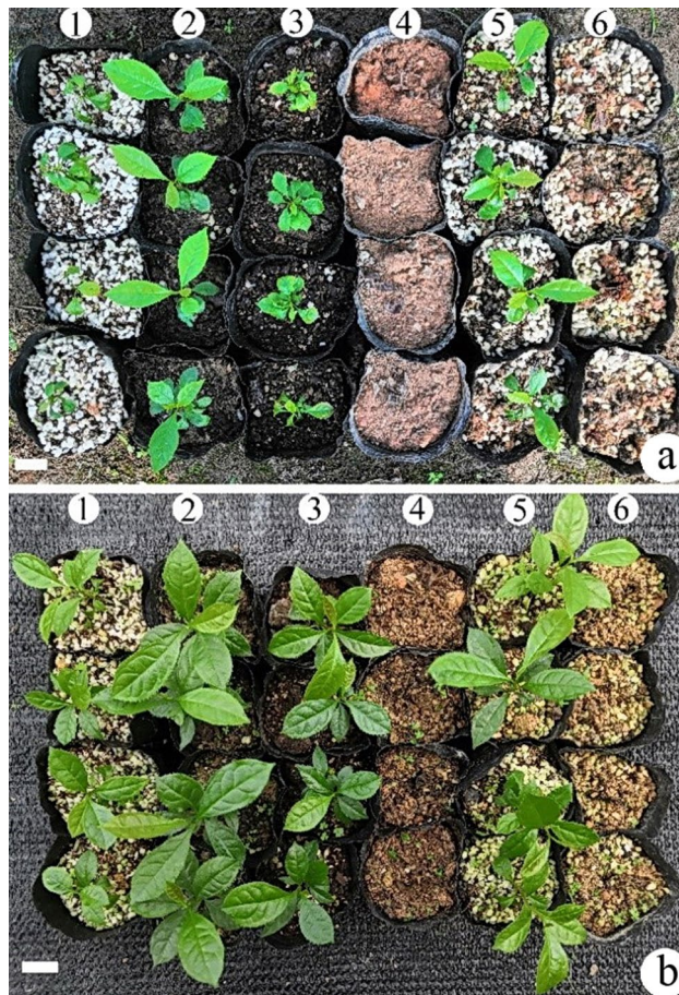
Figure 3. Acclimatization and transplanting of Euryodendron excelsum . Bars = 2.0 cm. (a) Rooted plantlets were transplanted in different substrates for a month. (1) Vermiculite: pearl rock (1:1); (2) peatsoil: sand (1:1); (3) peat soil: vermiculite (1:1); (4) peatsoil: yellow mud (1:3); (5) peatsoil: yellow mud: vermiculite (1:2:1); (6) yellow mud: pearl rock: peatsoil (1:1:1). (b) Rooted plantlets were transplanted to different substrates for 3 months. (1) vermiculite: pearl rock (1:1); (2) peatsoil: sand (1:1); (3) peat soil: vermiculite (1:1); (4) peatsoil: yellow mud (1:3); (5) peatsoil: yellow mud: vermiculite (1:2:1); (6) yellow mud: pearl rock: peatsoil (1:1:1).

aeration. In contrast, almost all plantlets in substrates with yellow mud could not survive, so E. excelsum needs a well-aerated substrate for plantlets transplantation and recovery.