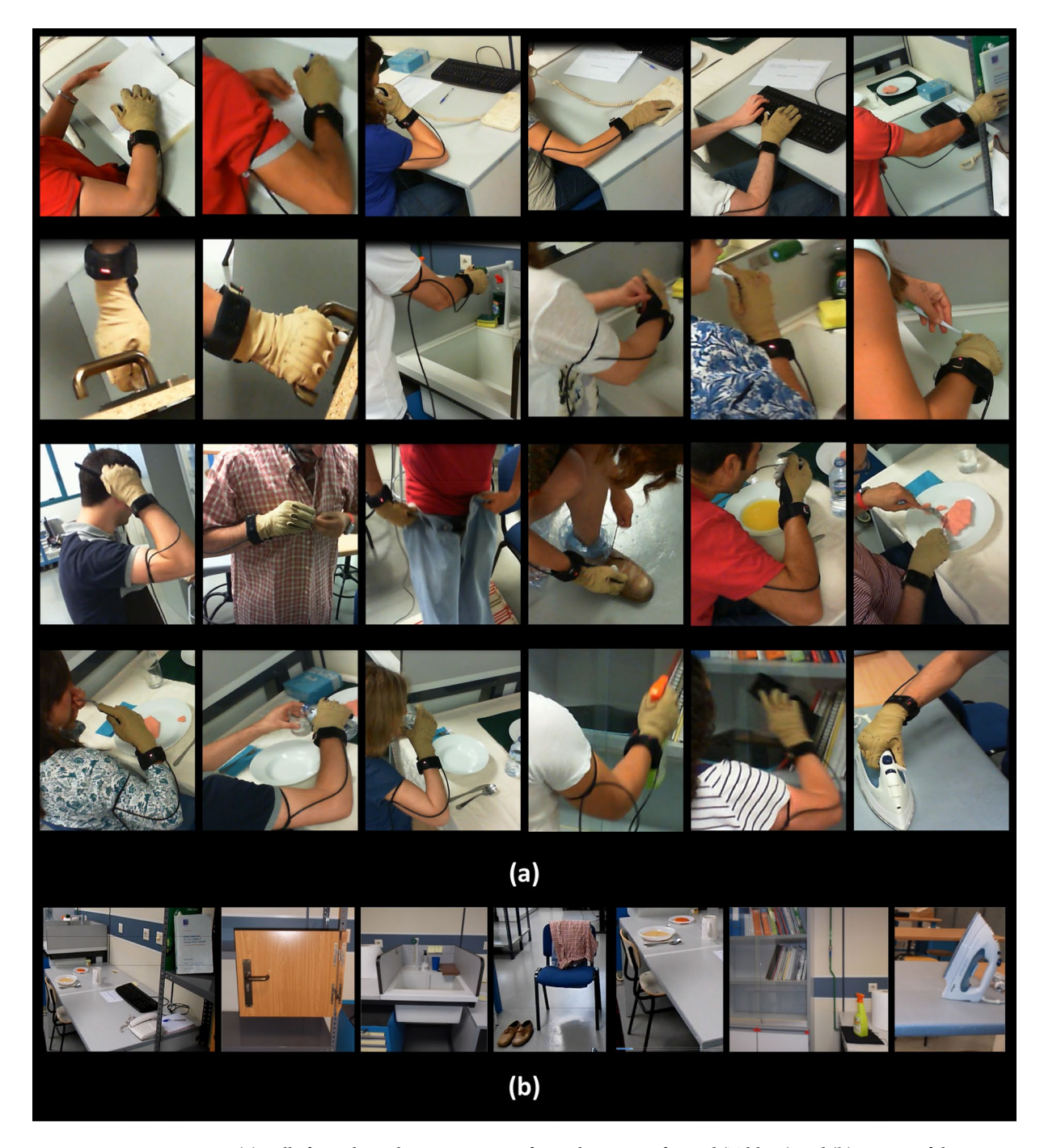
Figure 1. \ (a) \ Stills \ from \ the \ task \ execution, one for each \ ADL \ performed \ (Table \ II) \ and \ (b) \ images \ of \ the \ experimental \ scenarios \ with \ main \ real \ objects \ used.