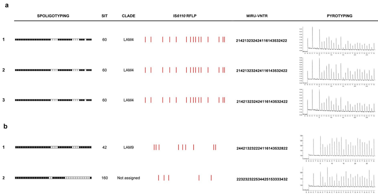
Figure 2. Examples of spoligotyping, IS6110-RFLP, 24-loci MIRU-VNTR, and PyroTyping results for some of the M. tuberculosis isolates included in this study. (a) Results for isolates sharing the same spoligotyping, IS6110-RFLP, 24-loci MIRU-VNTR, and PyroTyping profiles. (b) Results for isolates showing different spoligotyping, IS6110-RFLP, 24-loci MIRU-VNTR, and PyroTyping profiles. RFLP: restriction fragment length polymorphism. MIRU-VNTR: mycobacterial interspersed repetitive units - variable number of tandem repeats.