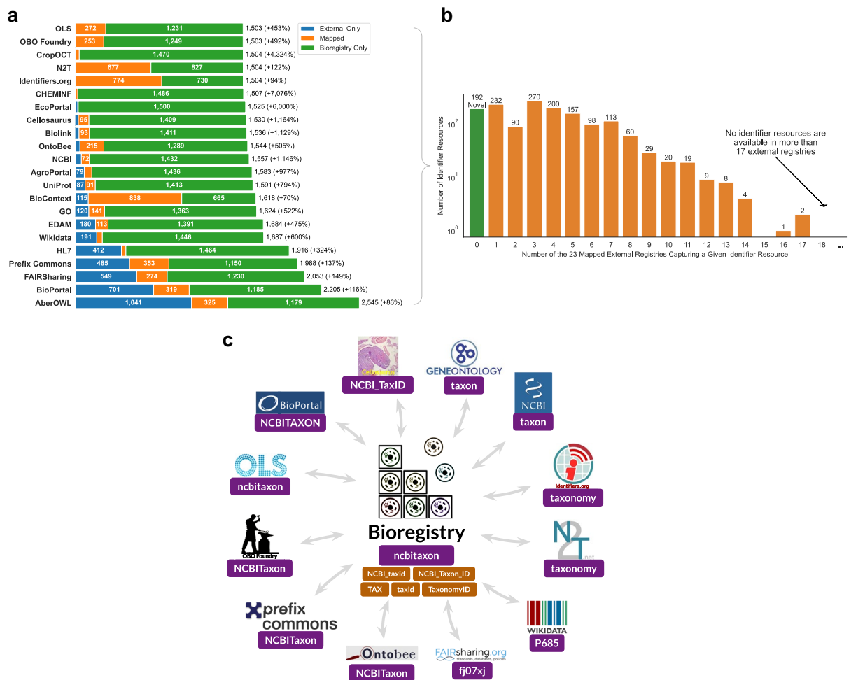
Fig. 1 (a) Summary of the pairwise overlap (in horizontal orange bars) between the prefixes in the Bioregistry and its integrated external registries. The horizontal blue bars show records that could not be automatically aligned and the horizontal green bars represent additional prefixes available in the Bioregistry but not the external resource. The absolute number of records in the union of the external registry with the Bioregistry (accounting for known overlaps) are shown on the right as well as the percentage relative gain introduced by the Bioregistry in parentheses. A large orange section corresponds to high content reuse while a large blue section corresponds to either high novelty of content in the external registry or high potential for semi-automated import into the Bioregistry. Counts on sections of these bar plots representing fewer than 70 prefixes are omitted. (b) A histogram of how many cross references each entry in the Bioregistry has to external registries. The green bar highlights the prefixes with no cross references that only appear in the Bioregistry. (c) A schematic diagram depicting the Bioregistry as an interoperability layer between external registries. Using the NCBI Taxonomy identifier resource as an example, prefixes used for this resource in external registries that the Bioregistry aligns are shown in purple boxes. Additional synonyms for this resource curated in the Bioregistry are shown in orange boxes. The components of this figure are regenerated daily with GitHub Actions and stored in https://github.com/bioregistry/bioregistry/tree/main/docs/img .

entry, and added them to the Bioregistry. Several novel prefixes were suggested by external contributors who were themselves the maintainers of the corresponding resource. Another subset of these entries were added by members of the community who encountered them and were then motivated to create an entry for it in the Bioregistry.