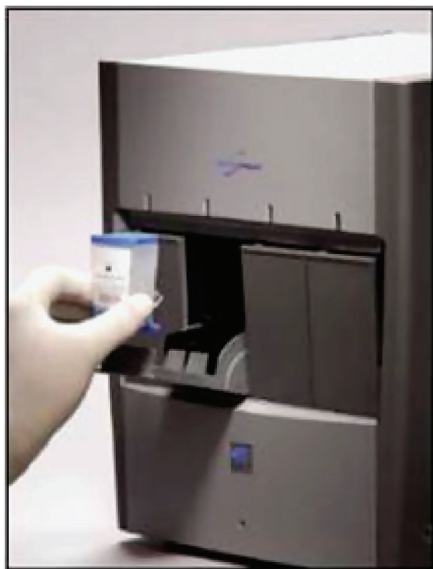
Figure 2. Xpert MTB/Rif.

Nevertheless, culture remains the gold standard technique for the diagnosis of TB, even though its large-scale use is limited by the long waiting time due to the slow growth rate of mycobacteria (~2–6 weeks in liquid media) with consequent diagnostic delays; furthermore, the need for biosafety level 3 laboratory infrastructures and highly skilled laboratory technicians who are often lacking especially in resource-constrained settings is another significant limitation. 40 Drug susceptibility testing on solid or liquid culture is essential to confirm a diagnosis of MDR-TB, but its availability in low-income and high-burden areas is far less than is needed. Molecular tests, such as GenoType MTBDRplus, a line probe assay, that rapidly detects TB bacteria and identifies resistances to the most important first-line drugs (rifampicin and isoniazid) and to some second-line molecules in its latest version, are often used as substitutes for conventional drug susceptibility testing, although their implementation is still challenged by high costs and complex technical requirements. 41,42 The MTBDRsl molecular test has been recently endorsed by WHO. 43 Whole-genome sequencing is under investigation as a potentially promising tool to detect relevant mutations that could predict drug resistance and help to design individualised therapeutic regimens. 44