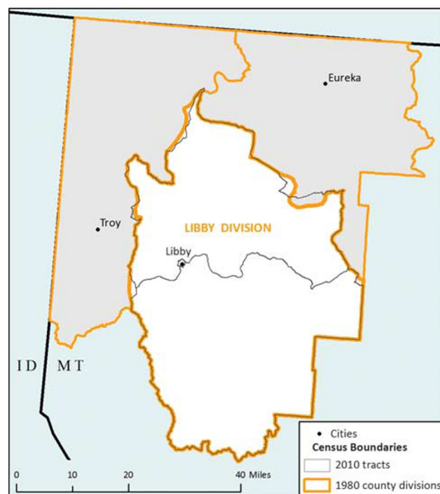
Figure 1. Map of geographic boundary (Libby County Division, 1980) used to assess mortality rates in Lincoln County, Montana.

In order to calculate the most accurate SMRs, we were limited by the available census data for the rural area around Libby. Detailed census data were available as early as 1980 by the County Division level within Lincoln County, and the Libby County Division was selected as our study area boundary for inclusion of decedents (Figure 1).