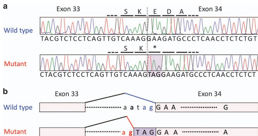
Figure 2. Single-nucleotide substitution-induced splicing abnormality in the patient. (a) CHD7 cDNA was reverse-transcribed using total RNA from blood-derived lymphoblastoid cells and was then PCR-amplified, cloned and sequenced. Sequencing revealed the activation of a cryptic splice site three bases upstream of position c.7165 in exon 34. Furthermore, the variant RNA contains the UAG (TAG) (*) termination codon immediately after the cryptic splicing acceptor. (b) The schematic shows wild-type RNA and the consequences of the substitution at the -4 position of intron 33. In the wild-type gene, splicing occurs at the wild-type splice acceptor at the beginning of exon 34. The c.7165-4A>G substitution at the end of intron 33 activates a cryptic splice site immediately upstream of position c.7165 in exon 34. Moreover, all tested cDNA clones with the A polymorphism at c.7356 possessed a cryptic splice site.

Mutation Taster ( http://www.mutationtaster.org/index.html ), NNSPLICE (Berkeley Drosophila Genome Project) ( http://fruitfly.org/seq_tools/splice.html ), Human Splicing Finder ( http://www.umd.be/HSF3/index.html ) and MaxEntScan::score3ss ( http://genes.mit.edu/burgelab/maxent/Xmaxentscan_scoreseq_acc.html ) were used for predicting splice site alterations.