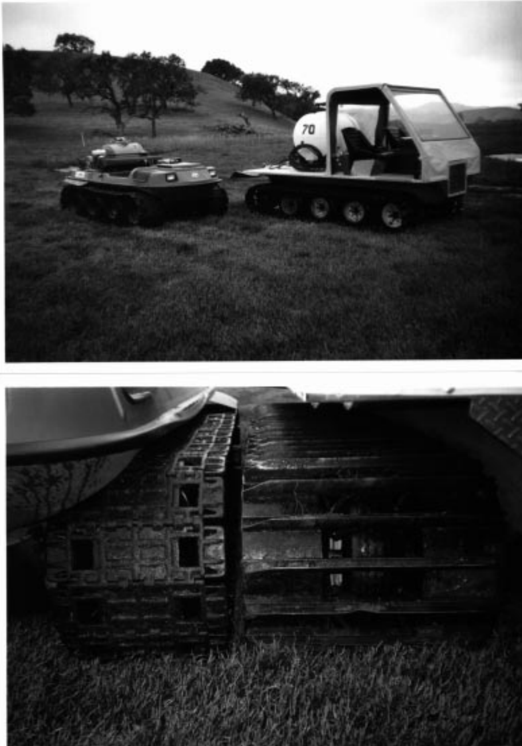
Figure 2. The ATVs used in this study, the Argo™ (top left) and Lightfoot™ (top right). Track morphology showing the steel grouse on the Lightfoot™ compared to the flat plastic tread of the Argo™ (bottom).