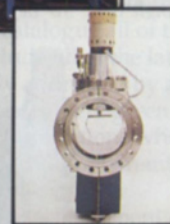
Beam Profile Monitors

Please visit Booth No. 708 at the MRS Equipment Exhibit/ Table Top Display in Boston, Nov. 30–Dec. 2, 1993.