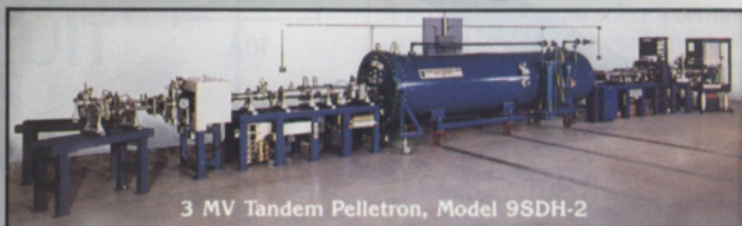
3 MV Tandem Pelletron, Model 9SDH-2

Tel. 608/831-7600 • Telex 26-5430 • Fax 608/256-4103