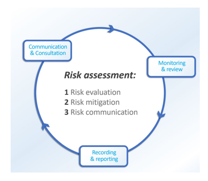
Fig. 2 The three-step WHO Risk Assessment approach during Mass Gatherings. Adapted from the WHO [18]

2019, and COVID-19 in 2020 [16]. A recent summary of multiple documents for risk assessment, mitigation and communication during mass gatherings (Fig. 2) had been produced and summarized by the WHO Regional Office for Europe/ECDC [17]. In addition to risk assessment, host countries of MGS should include a system for thorough identification, screening, testing and contact tracing of any identified MPXV infection. A frame work had been developed by the WHO [18]. And such a system is well developed in certain MGs such as the Hajj [19], and this system could be adopted for other MGs by other organizers and countries hosting such events. There is a continued need to have strategic coordinated surveillance, appropriate testing, and epidemiological evaluation for any emerging infectious disease at all stages of MGs (before, during, and after MGS).