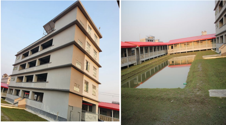
Fig. 3 Cyclone shelter center and housing.

this Island. In coastal areas, the water may be available around 150–200 m underground. In the coastal area, water is reserved as a 'fully confined area' which is called a fully confined aquifer. 17