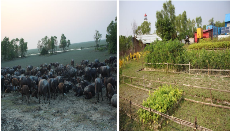
Fig. 6 Livelihood opportunities in Bhasan Char.

and save people (Mallick et al. 2017). Moreover, the country has been successful in tackling frequent disasters and reducing the death toll and damage to property (Haque et al. 2012).