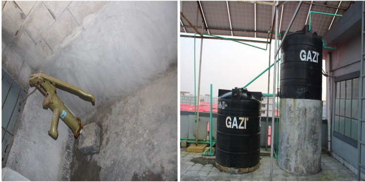
Fig. 4 Available water and sanitation facilities.

construction of planned canals for the drainage system and a landfill site under construction in the project location.