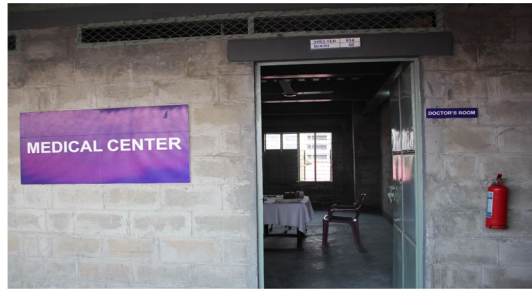
Fig. 5 Medical facilities for the Rohingyas.

from one cluster to another without any problems." 33 In case of movement, they will not face any security problems.