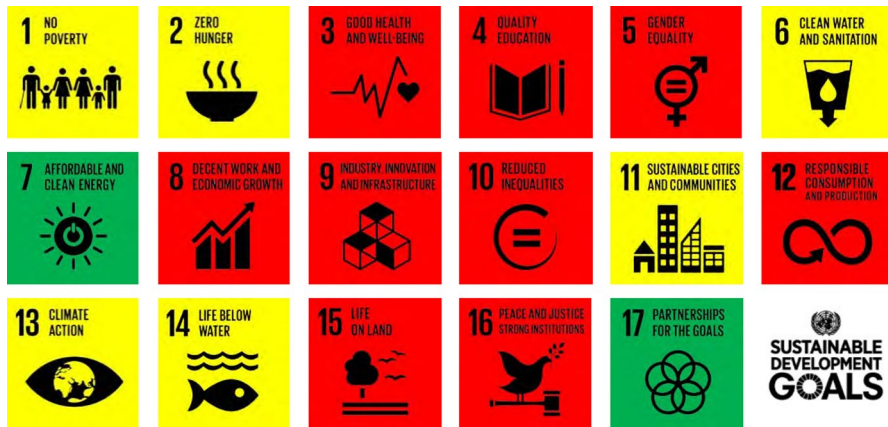
Fig. 1 Dashboard based on the average performance by SDG for Brazil, indicating whether the country has achieved or is on the path to achieve the goal (green), is in a “caution lane” (yellow), or is far from achievement (red).

involved: the Federal Government saves financial resources, and the MAs through its more sizeable capacity have easier access to the means of financing in these sectors (Slack 2011). The result is also favorable for accomplishing the Agenda 2030: with the appropriate resource, integrated policies will support municipalities in operationalizing the SDGs, particularly those with regards to basic services. All SDGs have goals directly linked to the responsibilities of local and regional governments, and that is why “local and regional governments should be at the heart of Agenda 2030” (Prakash et al. 2017).