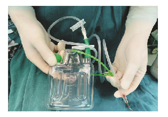
Fig. 2 Representative photo showing the drainage tube connected to a 200 ml drainage bottle with negative pressure

Drawing TXA stock solution into the syringe from the vial. c Drawing physiological saline into the same syringe containing desired amount of TXA stock solution