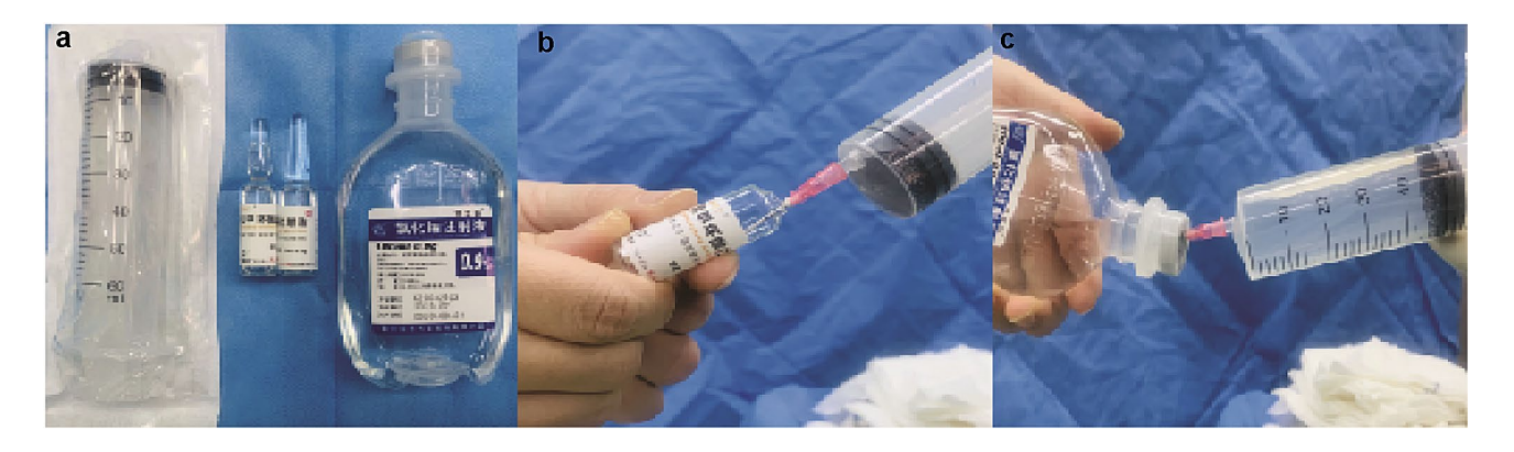
Fig. 1 TXA solution preparation. a Tools and drugs used in the preparation of TXA solution. Left: 60 ml syringe; middle: TXA stock solution in vial (100 mg/ml); right: physiological saline used. b

Drawing TXA stock solution into the syringe from the vial. c Drawing physiological saline into the same syringe containing desired amount of TXA stock solution