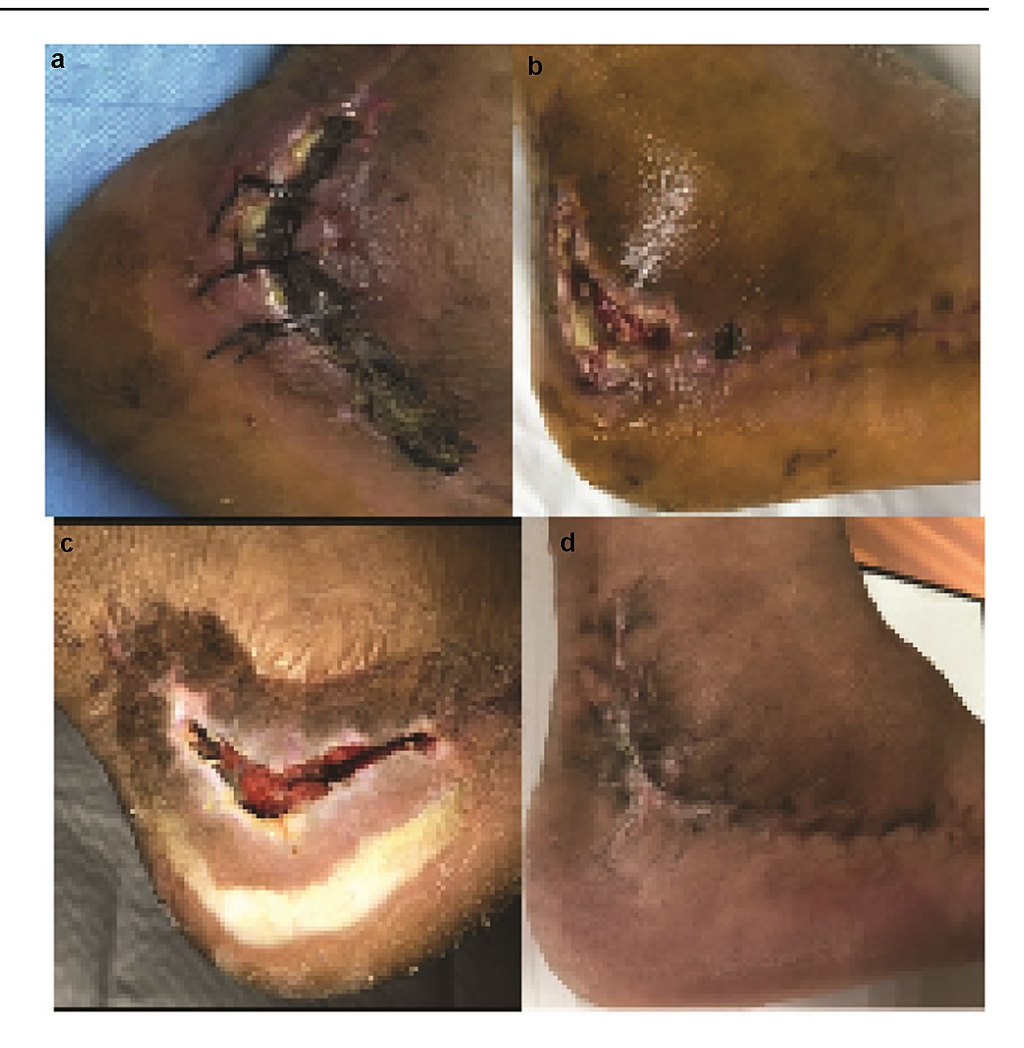
Fig. 4 Representative photo of wound complications. a , b , c Wound; d healed wound

calcaneal fracture to see if it can reduce the blood loss without inducing other complications. The results presented in our study demonstrated perfusion of TXA into the incision effectively reduced the postoperative drainage amount at day one and day two after the surgery without increasing the risk of coagulation, and the postoperative hemoglobin level was higher in TXA treated patients than that of saline-treated patients, suggesting that local administration of TXA is a promising approach to avoid large amount postoperative blood loss in surgeries for calcaneal fractures. Notably, we did not find the higher concentration of TXA (10 mg/ml) in terms of reducing blood loss, suggesting that the concentration of 10 mg/ml of TXA is enough.