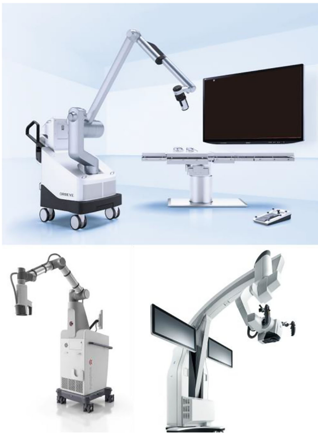
Fig. 3 ORBEYE (upper) (From [9], with permission of Olympus Medical Systems; https://www.g-mark.org/award/describe/47719?locale=en ); Modus V (lower left) (From [10], with permission of Synaptive Medical Inc.); and KINEVO 900 (lower right) (From [11], with permission of Carl Zeiss Meditec Co.)

equipped with two 4K Exmor R® CMOS image sensors by SONY and provides high-definition 3D digital visualization on a monitor.