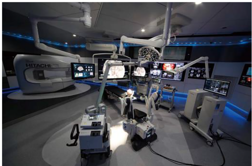
Fig. 1 Overview of Hyper SCOT [6••].