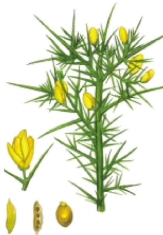
Fig. 1 Habit sketch of common gorse plant (GISP 2005)

Common gorse is a heliophile evergreen shrub, also known as European gorse, furze, or whin (León Cordero et al. 2016; Andreas et al. 2017; ISSG 2020). The plant usually grows up to 1 – 4 m from its woody multi-branched root system. Leaves are three-parted in young plants and are reduced to