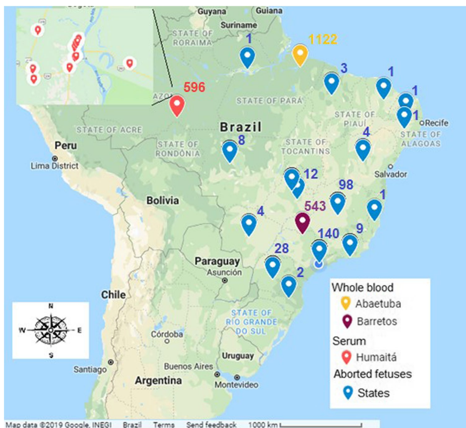
Fig. 2 Spatial distribution of whole blood samples, aborted fetuses, and serum analyzed. The inclusion shows details of the area where serum samples were collected. Map created by Google Maps

sp. (0/146). All of these results were kindly provided by the Biological Institute.