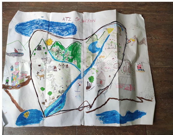
Fig. 2 Cartographic representations of Arhuaco sacred sites. (Intercultural School for Indigenous Diplomacy (EIDI))

Fig. 2 shows the social map drawn up with the participants on this occasion. They divided themselves into small working groups of women of different ages and collectively created various representations of the Arhuaco territory. The participants then listed the places they consider most relevant according to their personal and collective experiences. The map shows their identification of the sacred hills, the Kankurwas , sacred water bodies and important community settlements. Reflecting Arhuaco women’s process and the concerns they express in agreement with Arhuaco cosmology, this exercise gave rise to stories about the cultural damage to midwifery