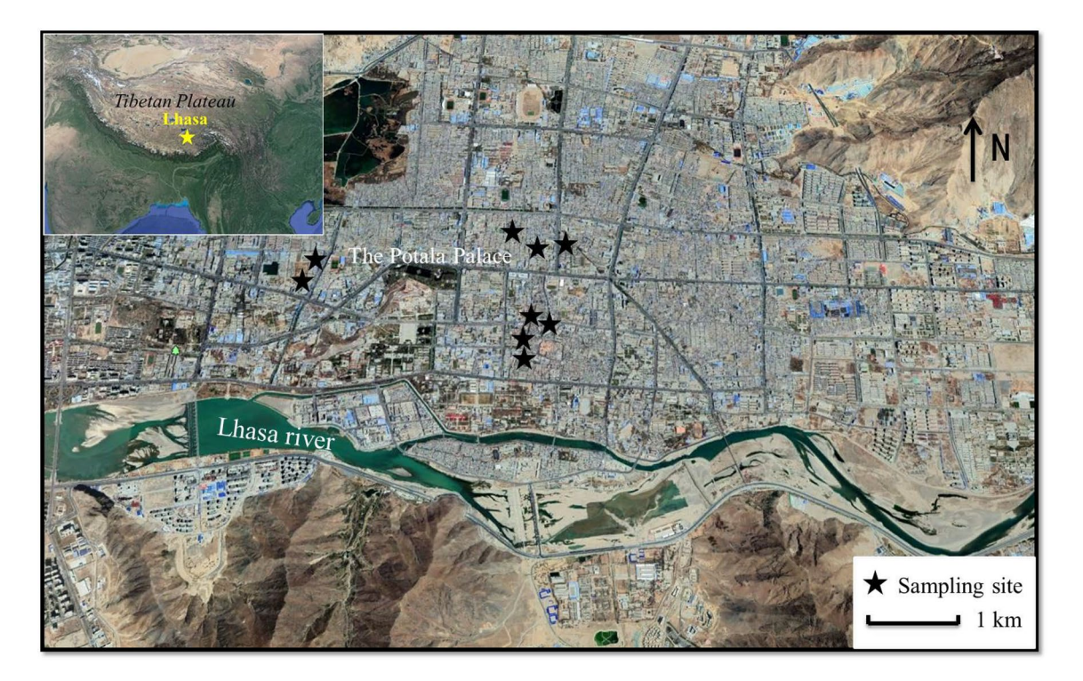
Fig. 1 Map showing the study area and sampling sites at Lhasa

other than cooking and seldom entering kitchens were selected as the control. Collected samples were stored in plastic bags and transported to laboratory for analysis.