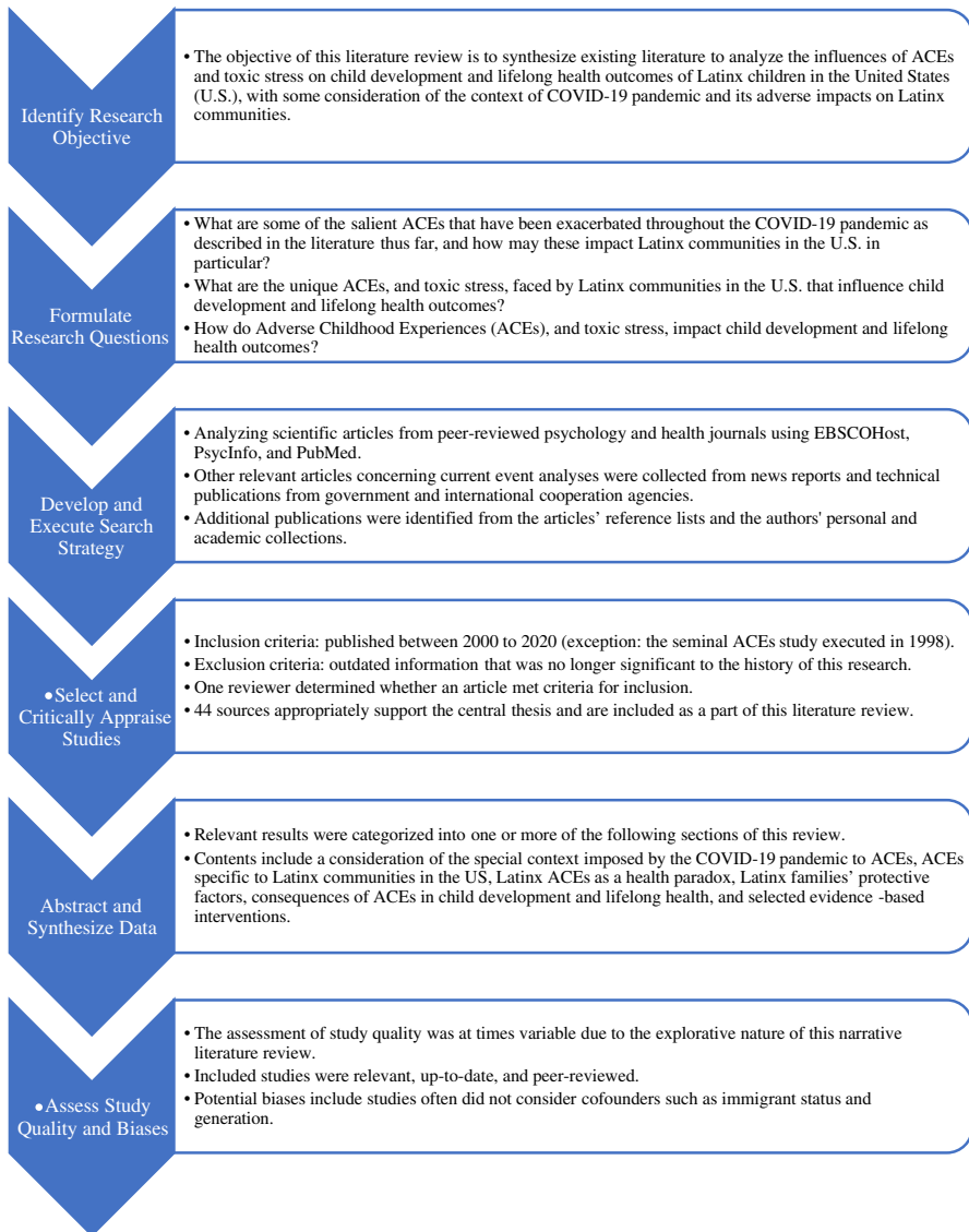
Fig. 1 Flowchart summarizing the process followed for the narrative literature review

was that all articles were written in English. The exclusion criteria include any outdated information that was no longer significant to the history of this research. One reviewer determined whether an article met criteria for inclusion. One hundred seventy-two sources were reviewed, and 25 of those were determined to appropriately address the central inquiries and thus included as a part of this literature review. Seventeen other sources were included from reference lists and the authors' personal files. In total, 42 sources were determined to appropriately