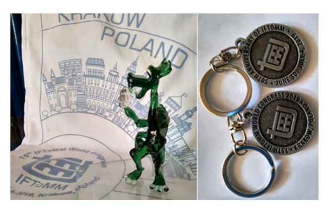
Fig. 8 Gifts at the 2019 IFToMM World Congress as memory of the IFToMM anniversary

The celebration finalized with a wine toast in a familiar frame and will live in the memory of all attendees through the specially designed celebratory congress gift to the attendees, Fig. 8.