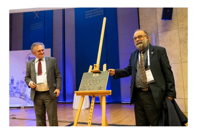
Fig. 4 The reveal act of the bronze commemorative plaque