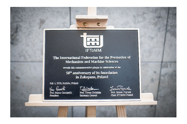
Fig. 1 The bronze commemorative plaque for the 50-year anniversary of IFToMM