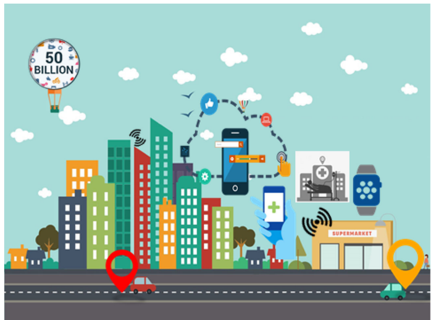
Fig. 3 Internet of medical things

There are many other big data analytics tools, a list of them can be found at http://bigdata-madesimple.com/top-30-big-data-tools-data-analysis/ .