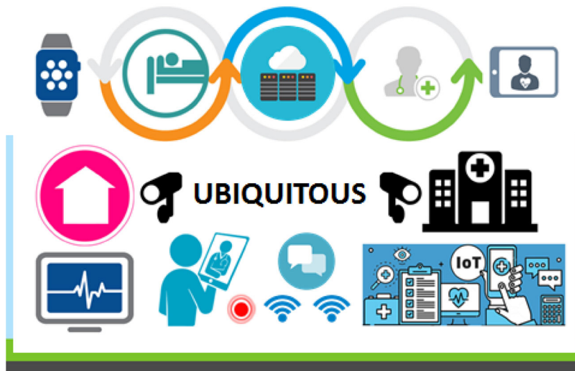
Fig. 2 Ubiquitous health system

Internet of Things (IoT) is a general paradigm. When dealing with medical environment, it is known as Internet of Medical of things (IoMT), which is same as the Medical Internet of Things. A discussion of IoMT can be found in [25]. The fundamental objective of IOT is to provide ubiquitous access to numerous devices and machines on service providers (SPs) [26], covering many areas such as location based services (LBS), smart home, smart city,