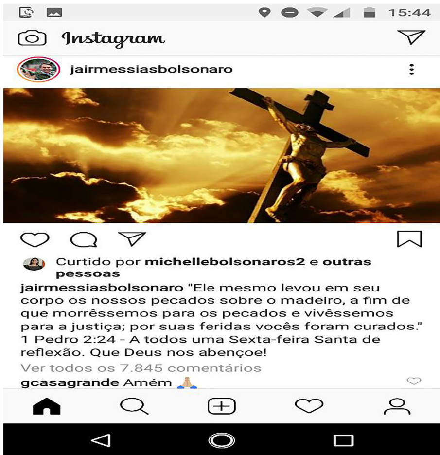
Fig. 1 Jesus Christ crucified and the theology of salvation