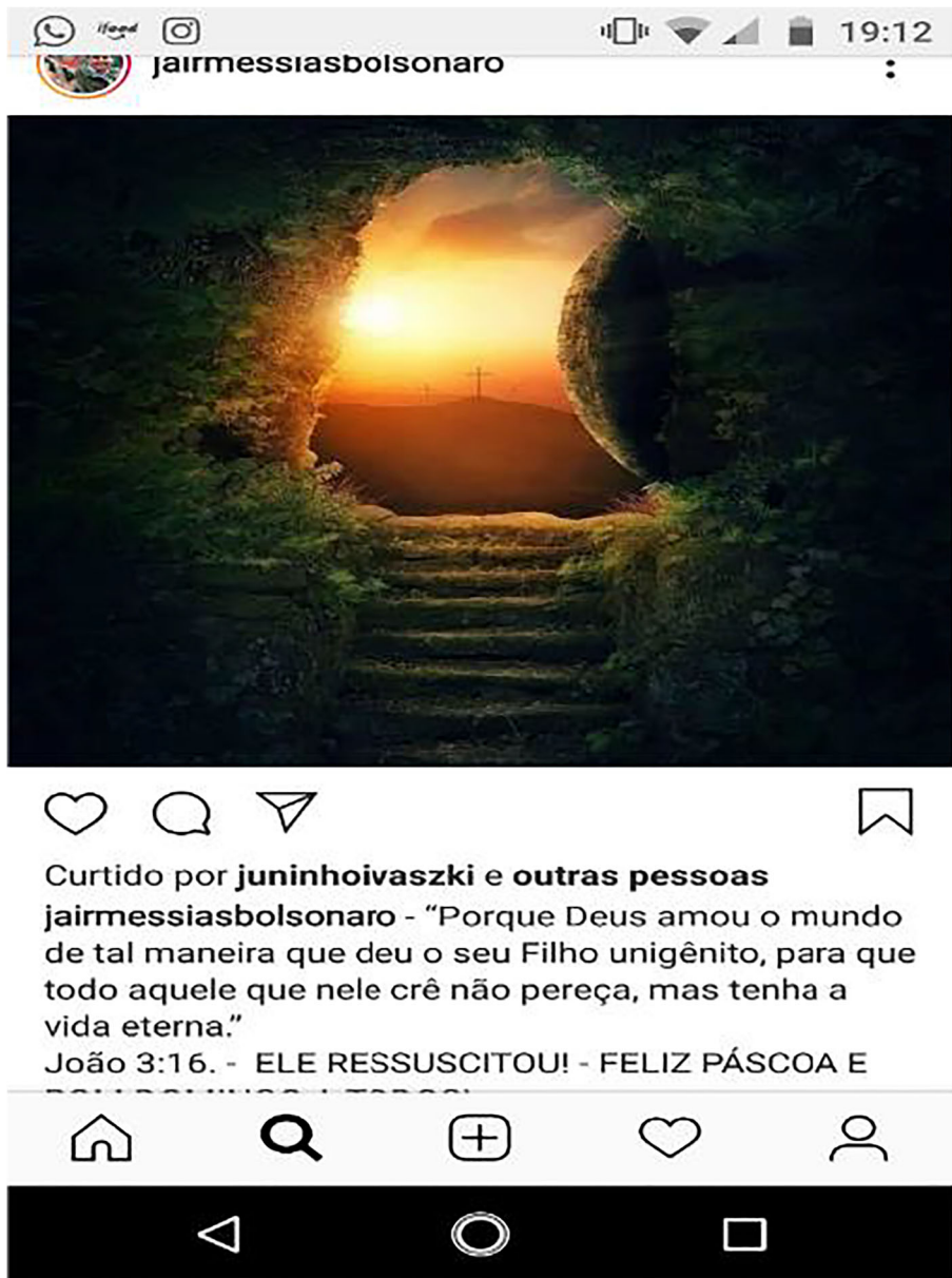
Fig. 4 Image about the resurrection of Jesus (Bolsonaro 2020a)

By the “scene composition” or configuration (Ranci ere 2012) in the Easter post (Bolsonaro 2020a), he affirms the key theme of the day: “He is risen.” Again, he demonstrates that he has intimacy with the Holy Scriptures and is thus in tune with the majority tendency of Brazilian Christianity. This is important to be addressed: with the set of posts, Bolsonaro is drawn as an authentic Christian of the great evangelical corporations, and his intellectuals (Gramsci 1982) operate this makeup in a very well treated manner (Py 2020).