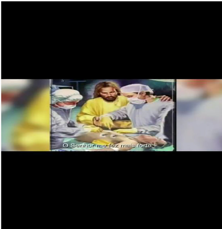
Fig. 3 Bolsonaro procteted by Jesus in the medical operation