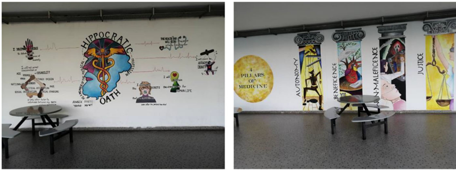
Fig. 2 Mural dedicated to the bioethics teaching and learning at the campus in the University of Malaysia