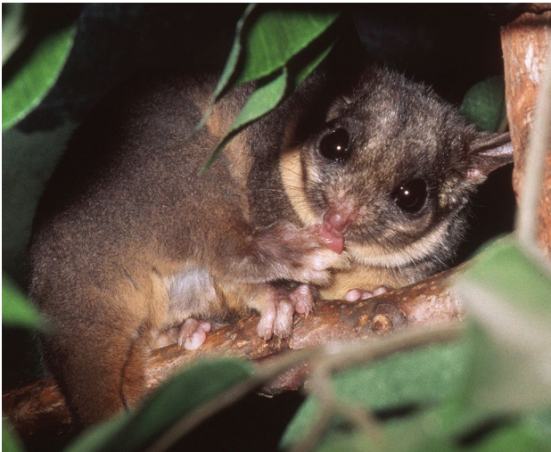
Fig. 1 Leadbeater's Possum

in site occupancy and disentangles such patterns from variations in survey effort across the species' range. Second and perhaps most importantly, the study illustrates not just the pattern of temporal change but also the processes underpinning those changes (in this case, loss of nesting tree hollows and a change in composition of forest landscapes). This is, in turn, critically important for informing management actions such as enhanced protection of targeted areas of forest such as those that supporting hollow-bearing trees.