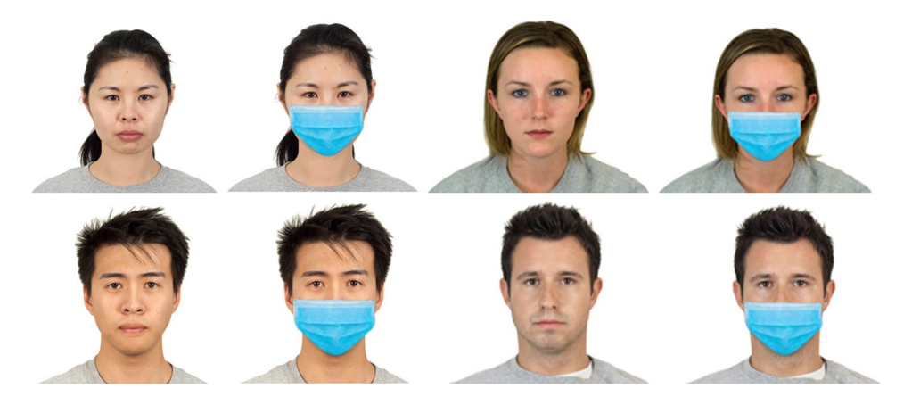
Fig 1 Unmasked and masked versions of example female and male stimuli from Asian and White heritage

were adequately powered to detect small effects (Cohen's f = 0.07, 1 - \beta = 0.80 ). Data were collected in August 2020 during the COVID-19 pandemic and not analyzed until the completion of data collection.