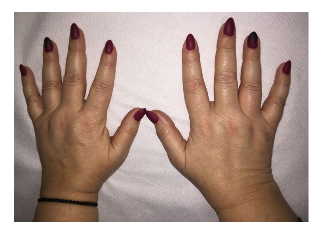
Fig. 1 Symmetrical swelling of the MCP and PIP joints bilaterally. MCP metacarpophalangeal joints, PIP proximal interphalangeal joints

free of symptoms. A new test for SARS-CoV-2 infection was negative. However, 1 month later she complained for arthralgias, morning stiffness, and swelling of the small joints of the hands. She repeated a new SARS-CoV-2 test which was negative.