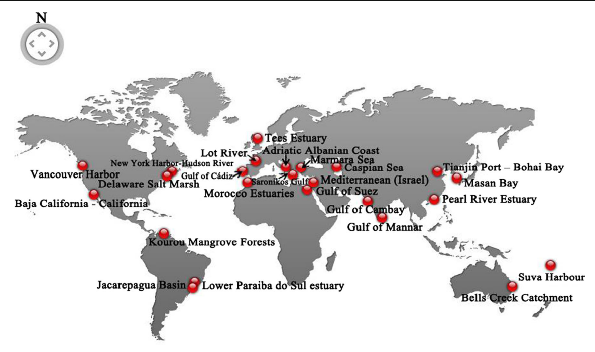
Fig. 1 Selected sites of estuaries and coastal areas worldwide

percentages of enrichment occur to As (100 %), Cd (73 %), Ni (58 %), and Cr (55 %). The results show that metal EFs reflect the impact of external metal sources on the sediment quality. Metal enrichment among the selected coastal areas is shown in Fig. 2 and summarized below: