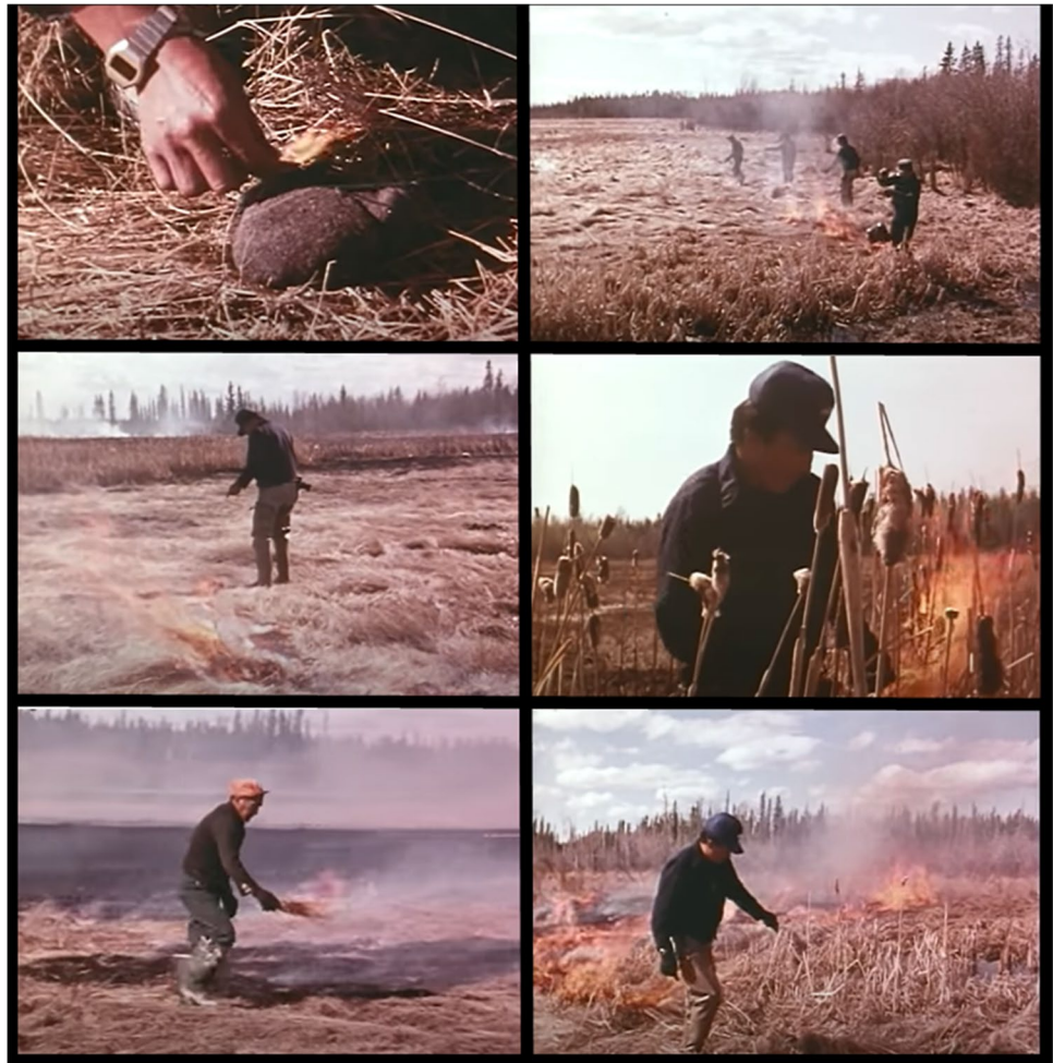
Fig. 2 Still images from the film “Fires of Spring” featuring Dene and Woodlands Cree burners in northern Alberta [65]

entities on the land. Indigenous conceptualizations of fire, relation and land offer radical alternatives to dominant approaches to fire and the environment. The boreal needs fire [9], and people need the boreal.