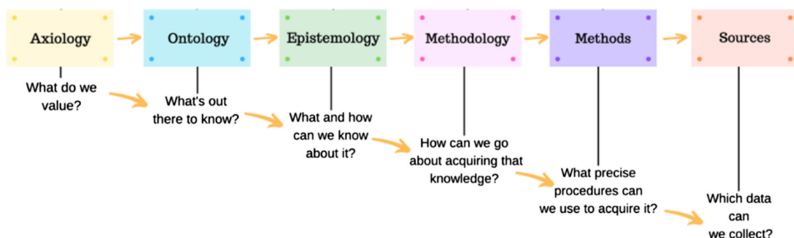
Fig. 1 The building blocks forming a piece of work's research paradigm and how they interrelate. Image is an adapted version of Grix's paradigmatic building blocks [15]. Image adapted by authors to include axiology as an important block not originally detailed

This may seem like an obvious consideration, but it is an area that is often not consciously reflected upon within medical science education research. What is your motivation to study this topic? Have you been practically, academically, or politically motivated? In other words, is it something you have