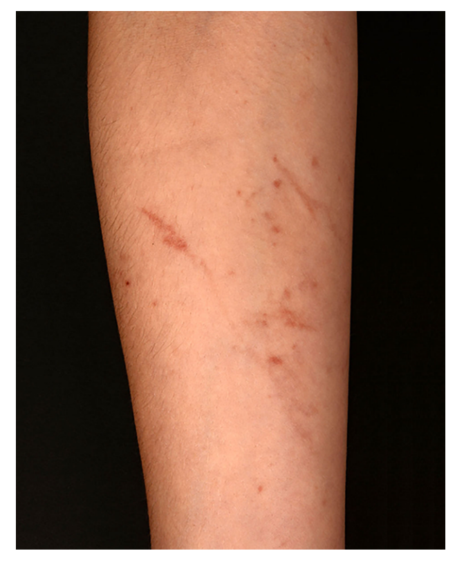
Fig. 2 Phototoxic contact dermatitis on the inner side of the forearm after contact with a plant containing phototoxic substances and subsequent exposure to sunlight (meadow grass dermatitis). A typical feature is the streaky smear of the plant in question at the points of contact. Most of the triggering substances are from the group of psoralens (furanocoumarins) and are contained in the leaves, stems, and fruit clusters of the plant.

Allergic contact dermatitis may occur after previous sensitization to a contact substance (Figs. 3 and 4a; [4]). The triggering allergen contact is then generally direct skin contact. However, it can also be triggered