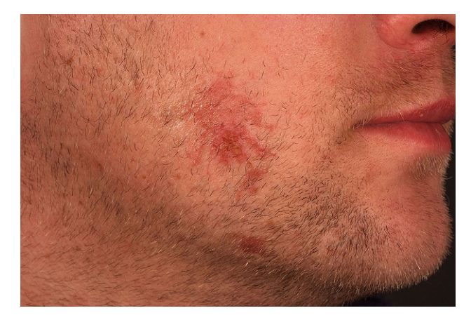
Fig. 1 Acute irritant contact dermatitis on the right cheek of a locksmith caused by splashes of a chemical containing anthracene and carbazole, which is classified as irritant to the skin according to the safety data sheet, during sampling at the workplace. The bizarre clinical picture with finger-shaped extensions is striking. A Medical Accident Report was submitted to the responsible Employer's Liability Insurance Association for Raw Materials and the Chemical Industry (BG RCI).

itive, or chronic exposure to the skin without the involvement of adaptive (specific) immune defenses [4]. These include detergents and other chemicals as well as water and sweat after occlusion of the skin. Exposure of the hands is of particular importance in this context [5].