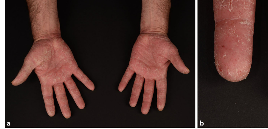
b to rye and wheat flour was found. The responsible professional